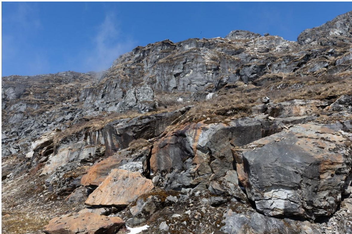
Sela Pass area

Sat 22 nd March. Today we birdwatch the Tawang area looking for similar species to yesterday.