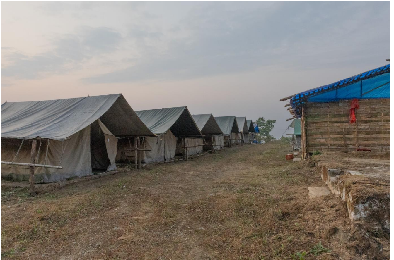
Accommodation Bompu Camp