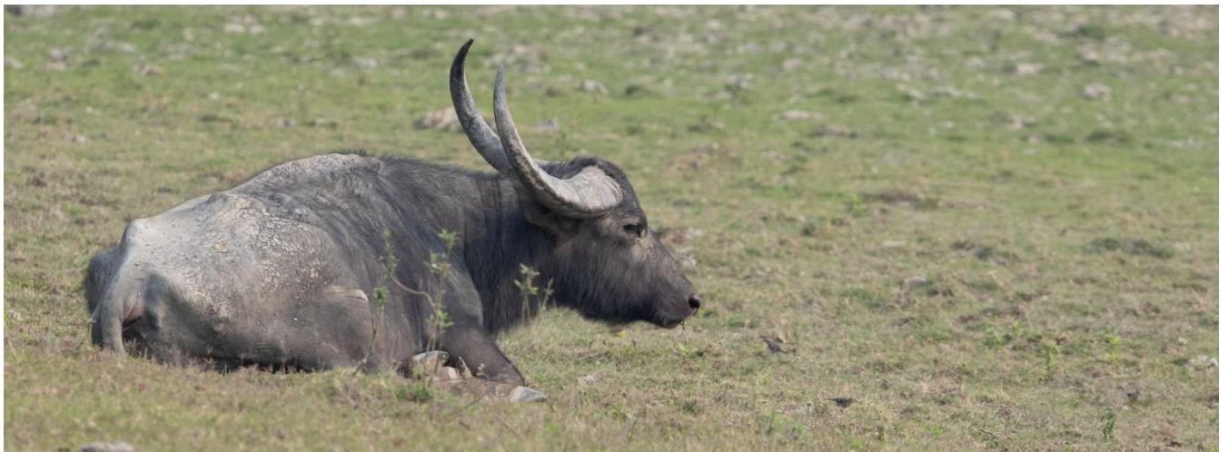
Asian Water Buffalo

Thurs 3 rd April. Morning and afternoon game viewing and birdwatching. We can expect more elephants and wild Water Buffalo and we will look for Capped Langur. We will take our time to search out many more birds here.