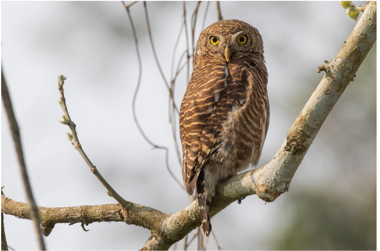
Asian Barred Owlet