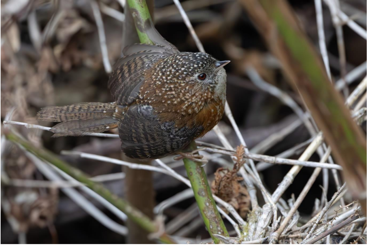
Bar-winged Wren Babbler

Mon 24 th March. In the morning we birdwatch the Mandala Road area. We will look for Black-tailed Crake, different species of treecreeper and nuthatch, Himalayan Buzzard, Himalayan Vulture, Himalayan Bluetail, niltavas, minlas, wren babblers and more. After lunch we drive to Lamacamp at Eaglenest. The journey is about five hours, but we'll birdwatch on the way.