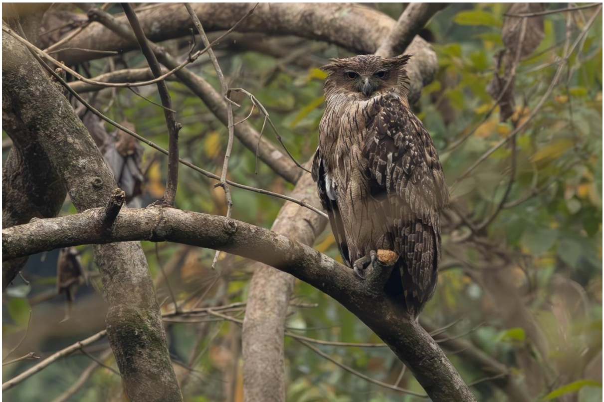
Brown Fish Owl