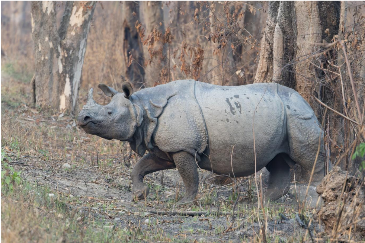
Greater One-horned Rhino

Sun 30 th March. Morning and afternoon game viewing and birdwatching in the Kaziranga National Park, most famous for the large population of Indian One-horned Rhinoceros, there is a lot more to see here. Rarities here include Pallas's Fish Eagle, Swamp Francolin and the Greater Adjutant Stork.