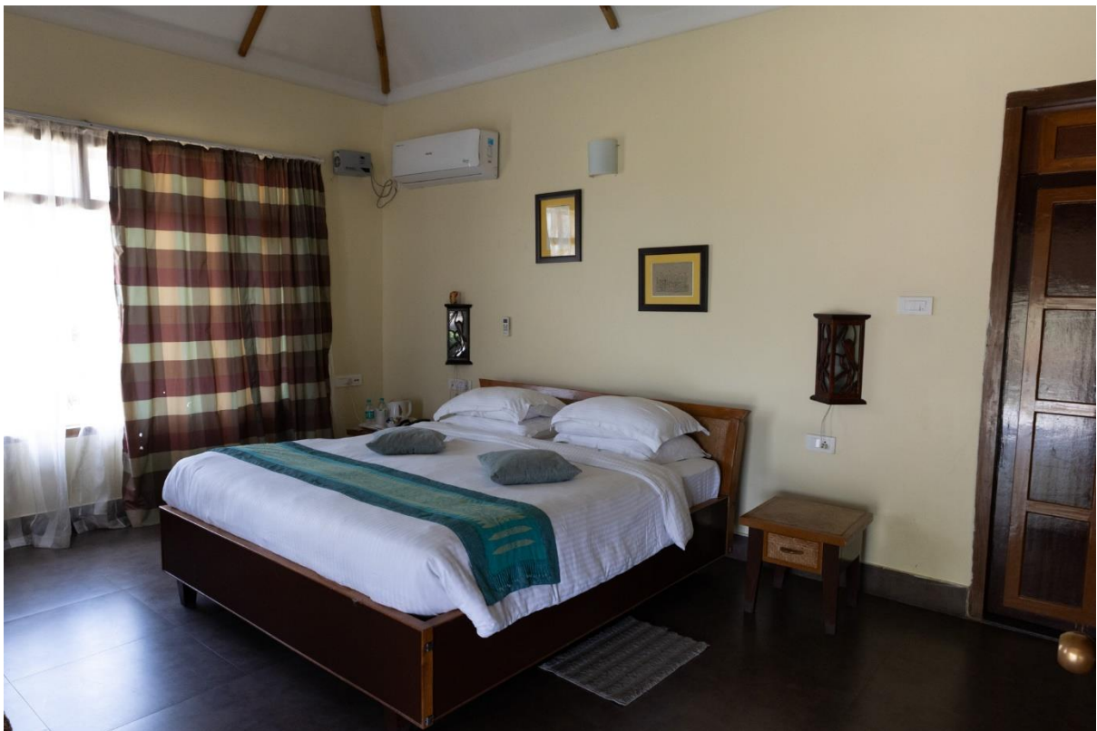
Accommodation at Manas