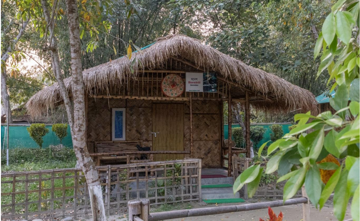
Baligora Eco Camp

eight-hour drive. Expect to see some good birds in the gardens and surroundings here, mynas, barbets, redstarts, treepies, bulbuls and more.