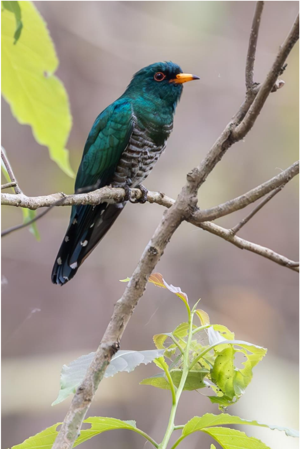
Asian Emerald Cuckoo