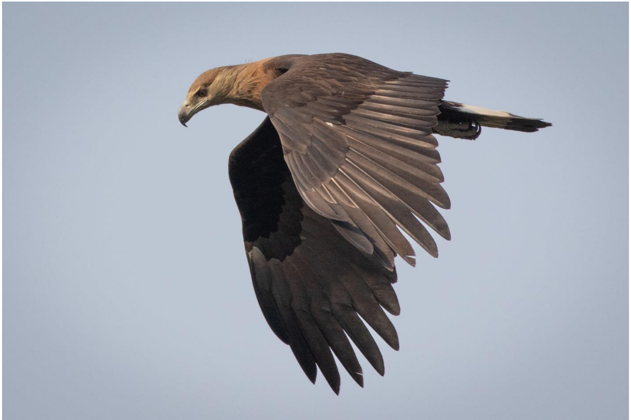
Pallas's Fish Eagle