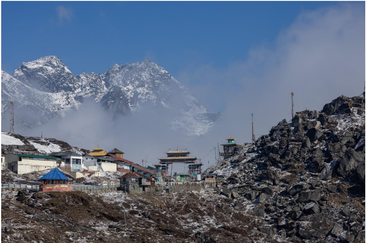
Road to Tawang

Sat 22 nd March. Today we birdwatch the Tawang area looking for similar species to yesterday.